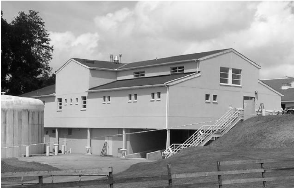
George D. Widener Large Animal Hospital